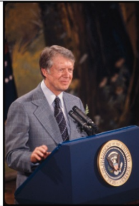
President Jimmy Carter, Town Hall meeting, Clinton, Mass. March 16, 1977. https://hdl.loc.gov/loc.pnp/gfgy.05260