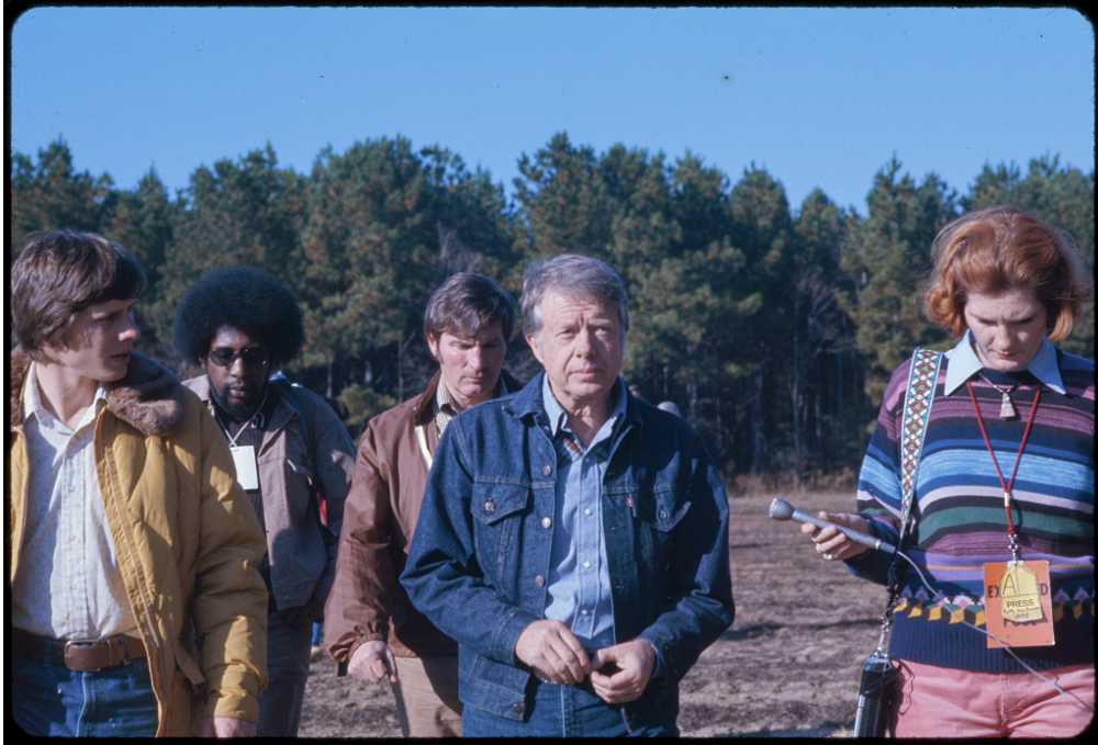
PRESIDENT JIMMY CARTER PLAINS, GEORGIA

Reference Link: http://www.loc.gov/item/2020735012/