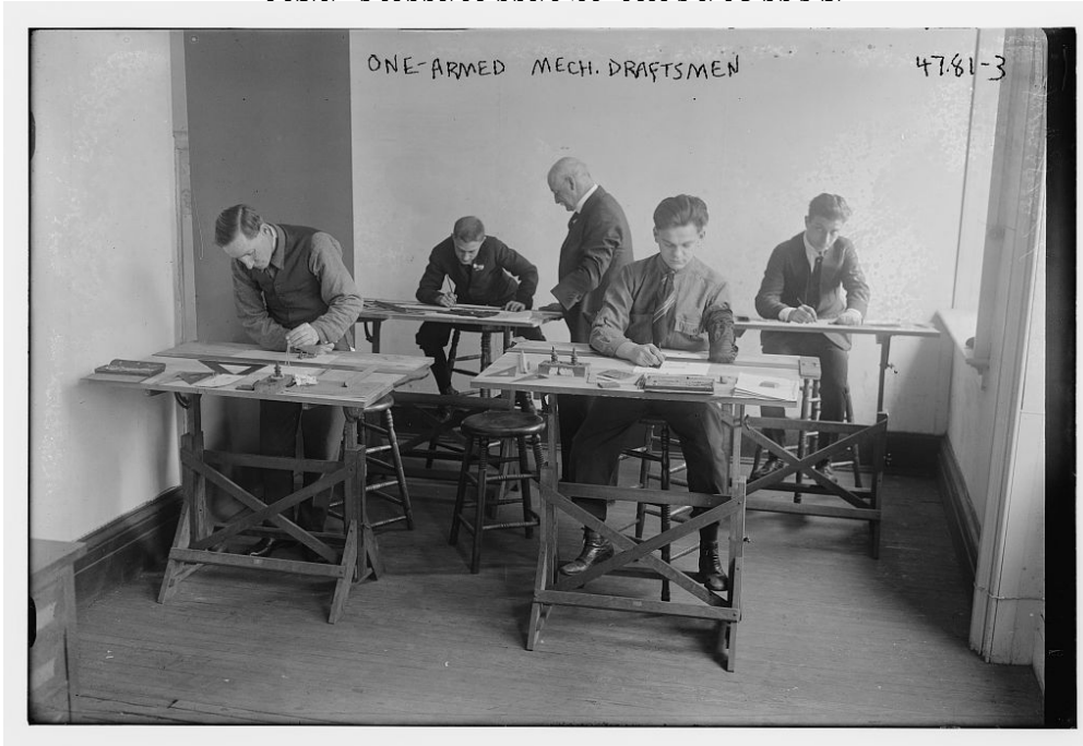
ONE-ARMED MECH. DRAFTSMAN

Reference Link: //www.loc.gov/pictures/resource/ggbain.27995/