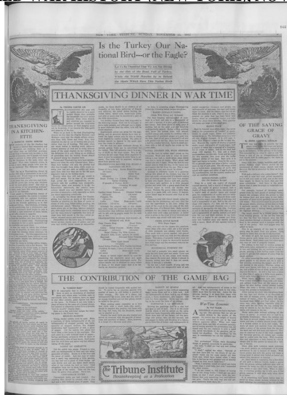
IMAGE 164 OF WORLD WAR HISTORY (NEW YORK), NOVEMBER 19, 1917, (1917