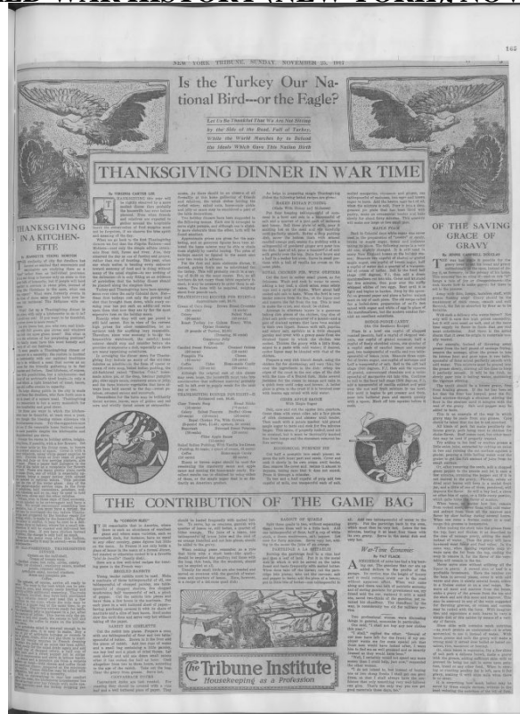
IMAGE 164 OF WORLD WAR HISTORY (NEW YORK), NOVEMBER 19, 1917, (1917