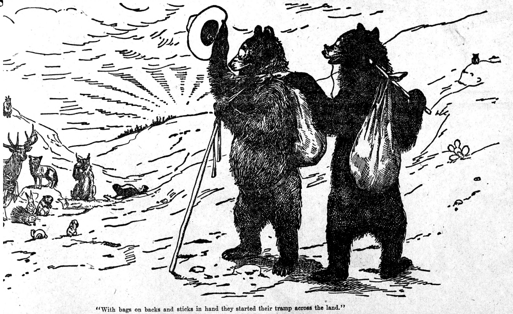
"With bags on backs and sticks in hand they started their tramp across the land."