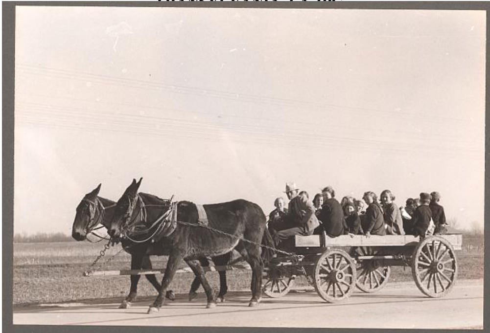
TRANSYLVANIA, LA. JRC