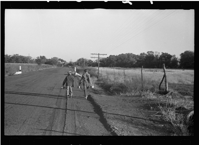
Farm children walking to one-room schoolhouse with lunch pails, Nebraska

You could even throw in a photo like this one to promote creative "What if?" questions.