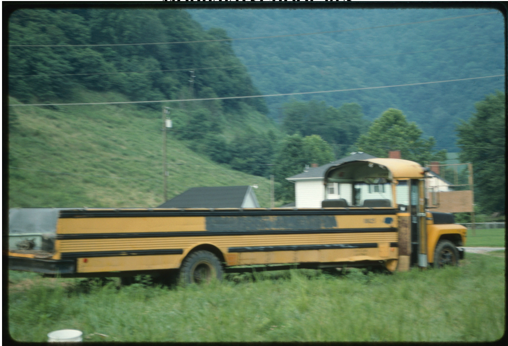
MODIFIED SCHOOL BUS