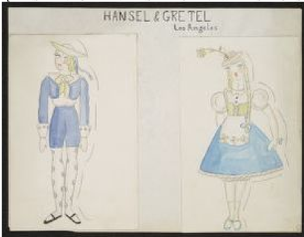
IMAGE 1 OF [ HANSEL AND GRETEL: HANSEL BLUE AND WHITE SAILOR SUIT. GRETEL

Reference Link: http://www.loc.gov/resource/musihas.200218852.0?st=image