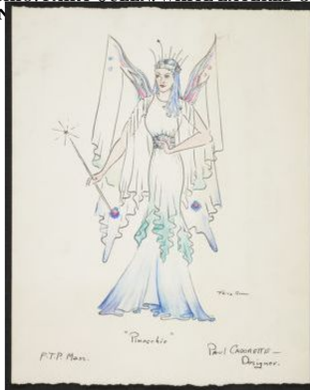
IMAGE 1 OF [ PINOCCHIO: FAIRY OUEEN. WHITE LAYERED GOWN WITH SHADES OF BLUE. TRAILING WING, AND BLUE HAIR.]

Reference Link: http://www.loc.gov/resource/musihas.200219305.0/?sp=1