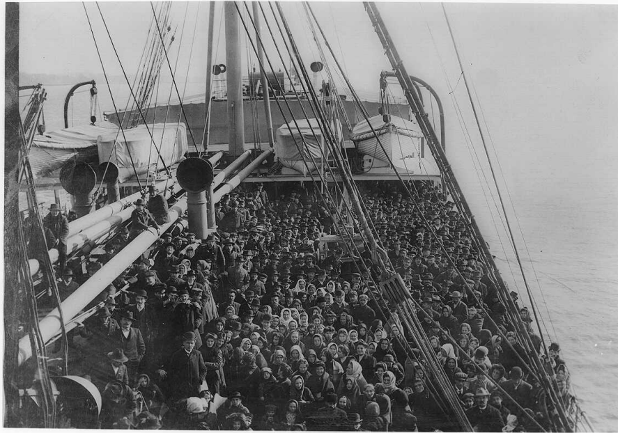
Immigrants on an Atlantic Liner.

Reference Link: https://www.loc.gov/pictures/item/97501073/