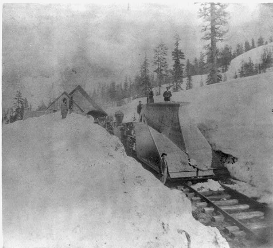
1263. Snow Plow of the Central Pacific Railroad Co. Near Cisco.

Reference Link: http://www.loc.gov/item/2002721309/