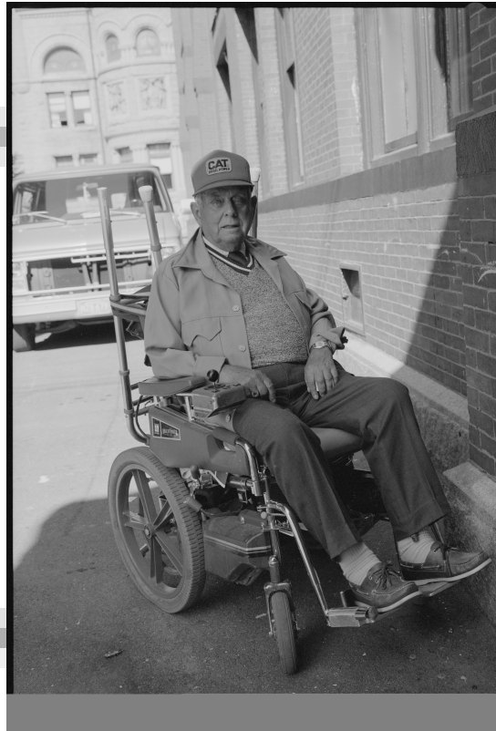
IMAGE 2 OF LOWELL COUNCIL ON AGING CENTER, LOWELL, MASSACHUSETTS