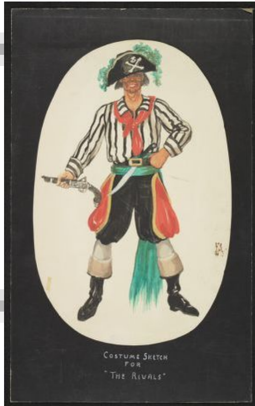
IMAGE 1 OF [PIRATES OF PENZANCE: COSTUME SKETCH FOR "THE RIVALS". STRIPED BLACK AND WHITE SHIRT, BLACK AND RED BREECHES, GREEN SASH, BLACK HAT, AND PISTOL.]

Reference Link: http://www.loc.gov/resource/musahas.200219334.0/?sp=1