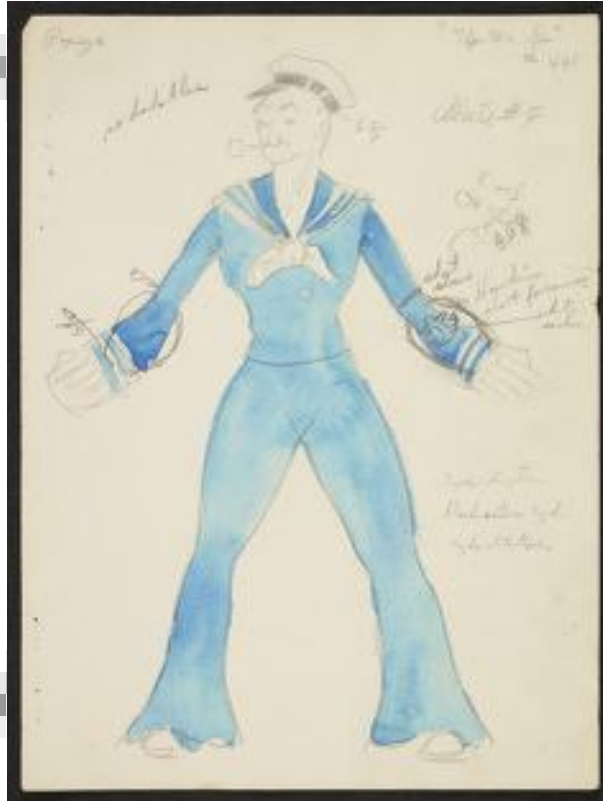
IMAGE 1 OF [ UP WE GO: POPEYE. BLUE SAILOR SUIT WITH WHITE CAP, AND CORNCOB PIPE.]

Reference Link: http://www.loc.gov/resource/musihis.200219968.0/?sp=1&r=-0.128,0.433,1.413,0.866,0