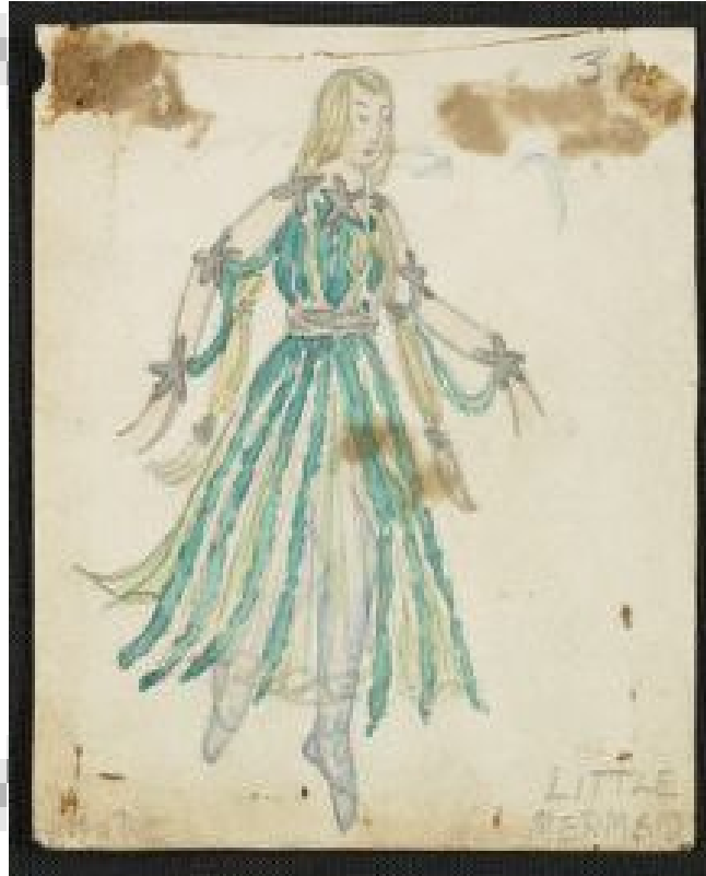
IMAGE 1 OF [THE LITTLE MERMAID: SHORE LITTLE MERMAID GREEN DRESS WITH STAR(FISH)]

Reference Link: http://www.loc.gov/resource/musihis.200218688.0/?sp=1