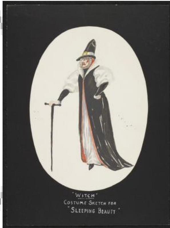
IMAGE 1 OF [ SLEEPING BEAUTY: WITCH. WHITE GOWN WITH BLACK COAT, AND HIGH COLLAR. PILGRIM'S HAT AND WALKING STICK.]

Reference Link: http://www.loc.gov/resource/musihhas.200219792.0/?sp=1&r=-0.756,-0.083,2.513,1.54,0