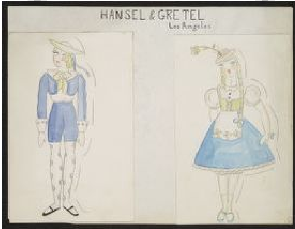
IMAGE 1 OF [HANSEL AND GRETEL: HANSEL BLUE AND WHITE SAILOR SUIT. GRETEL BLUE, WHITE, AND YELLOW DIRNDL]

Reference Link: http://www.loc.gov/resource/musihis.200218852.0?st=image