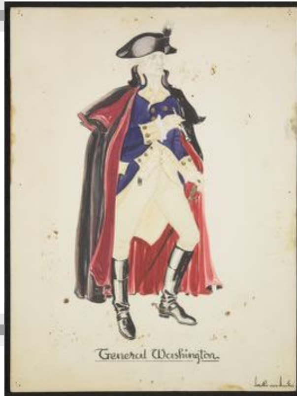
IMAGE 1 OF [ VALLEY FORGE: GENERAL WASHINGTON. BLUE COAT, CREAM BREECHES, BLACK BOOTS, BLACK COAT WITH RED LINING, SPYGLASS, SWORD, AND TRICORNE HAT.]

Reference Link: http://www.loc.gov/resource/musihis.200219985.0/?sp=1